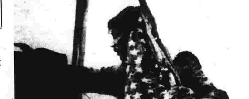
Marine carries flag to roof of Hue's Citadel.